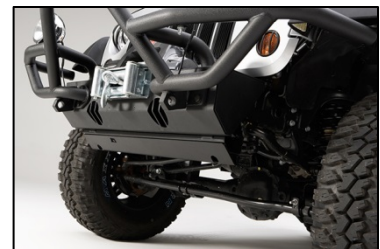
Above: Rugged Ridge Steering Component Skid Plate protects steering parts at the front of the Jeep, including the expensive electric sway bar disconnect system found on Rubicon models.

Rugged Ridge '07-'13 Jeep JK Wrangler Skid Plates are available online and through select Jeep and off-road parts/accessories retailers nationwide starting at $69.99 MSRP.